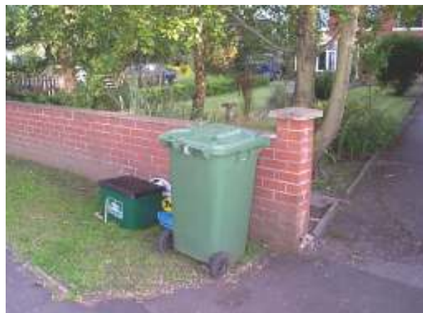
Green Bins, Blue Bags and Green Boxes Ready for Collection

On 'Green' collecting days very many residents can be seen to place the range of recycling containers outside their home for collection, now including, glass, tin cans, plastic and newspaper.