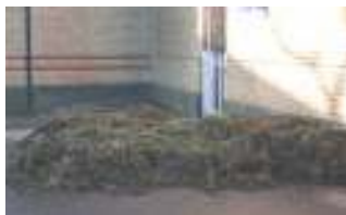
Part of Removed Spoil

Original condition before removing spoil to expose tiles.