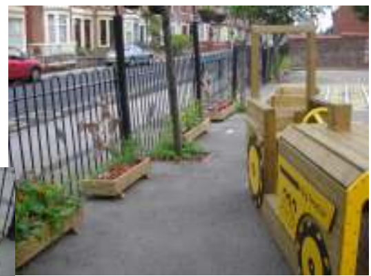
Wesham C.E.'s Playground Planting