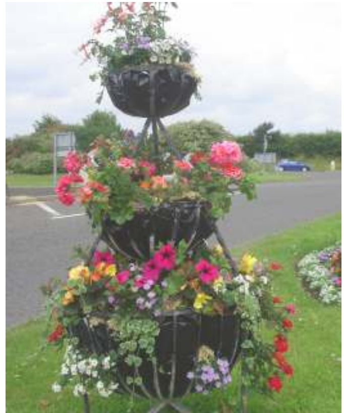
3 TIER PLANTER AT ASH BEND