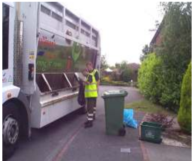
A typical Recycle collection

Recycling has been very well received by the residents of Wesham and the provision of the Green and Grey wheely bin scheme has been very well used. This has been further enhanced by the provision of the 'blue bag' paper recycling collection together with the 'Green Box' for glass bottles, plastic bottles and tin cans. In addition, Fylde Borough Council have a recycling site conveniently situated at the Community Centre and Derby Road for other recyclable items. This is proving to be well used by residents.