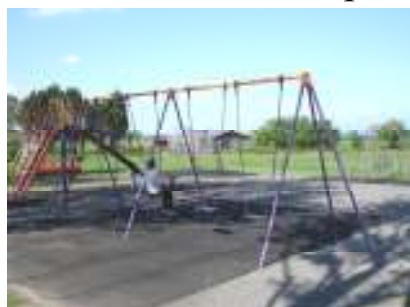
Fleetwood Road Swings