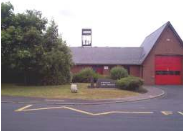
Wesham Fire Station

Wesham plays host to both the Fire and Ambulance Stations, both of which have permanent landscaping to enhance their appearance.