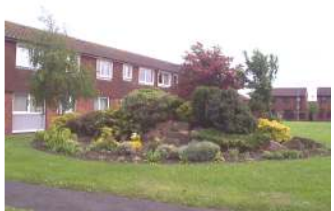
Permanent Planting at Derby House