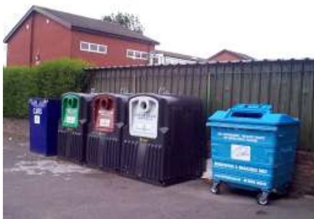
Recycling Site at the Community Centre for Paper, Glass, Clothes and Plastics