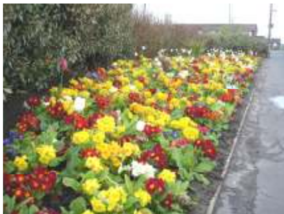
Beds located on Derby Road at Doorstep Green