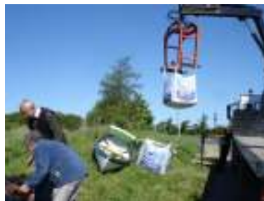
Soil and Gravel Delivery

A combined effort of WCPT members, The Prison Service, 'Woody's' and Wesham Gardening Group have enabled the provision of a floral boat at the bypass roundabout. The boat, supplied and painted by the Prison Service, installed by WCPT members and planted up in conjunction with Wesham's Gardening Group, run by Wesham Interact, which is funded by the Catholic Caring Society. The group had a setback at the beginning by the action of vandals who removed the boat from its' original 'mooring' and breaking the fixings before we were able to fill it with gravel and soil.