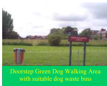
Doorstep Green Dog Walking Area with suitable dog waste bins

Wesham Town Council employ the street cleaning services of Fylde Borough Council to maintain the cleanliness of the local area. One off 'Operation Cleansweep' days are arranged from time to time by WCPT in co-operation with FBC, The Police and local volunteers.