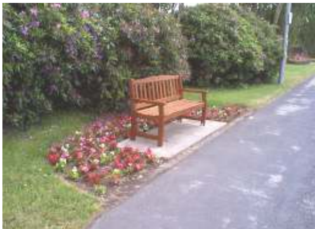
Seating at Fleetwood Road Playing Fields

At various locations throughout the Town seats are provided and are mostly enhanced by floral arrangements.