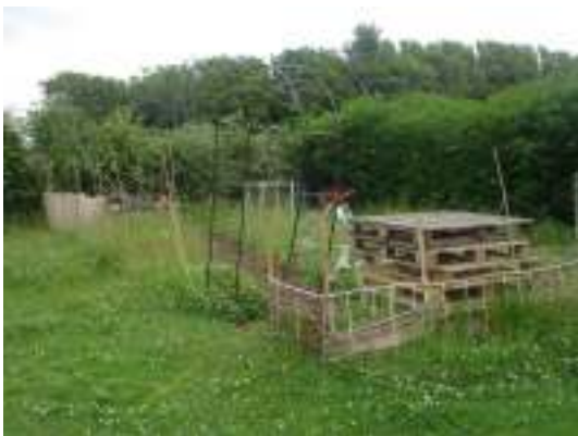
Wesham C.E.'s ECO Area 'Mini Beasts'