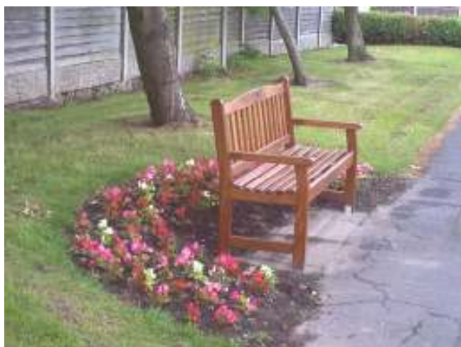
Seating at Meadow Park