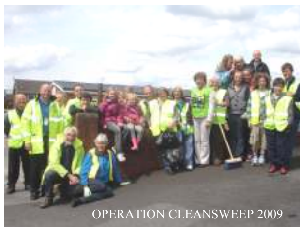
OPERATION CLEANSWEEP 2009