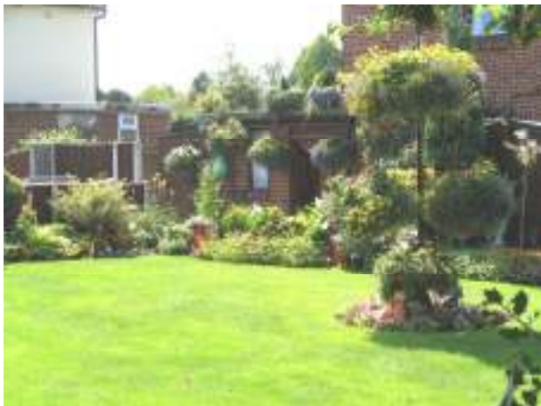
A WINNING LOCAL COMPETITION GARDEN

Many local residents take a great deal of pride in the appearance of their properties throughout the year. During the Christmas festivities, long after the growing period, many houses adorn their homes and gardens with decorations and lights to bring colour to the Town. Whilst many gardens are conventionally cultivated there are others that bring colour and aesthetically pleasing designs to add to the value of the area. A good example of a conventional garden is shown below.