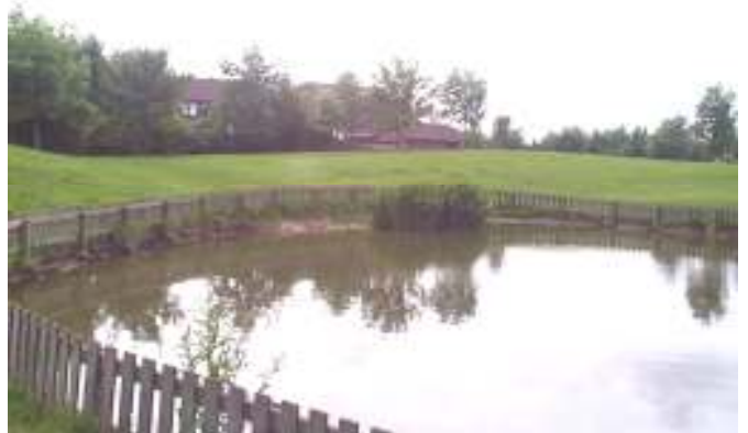
Bowland Grange Pond