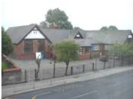
Wesham C.E. Primary

There are two primary schools located within the parish, St Joseph's Catholic Primary School and Wesham Church of England Primary School.