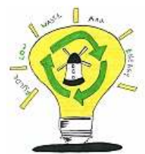
Fylde's ECO Logo