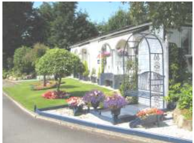
The 'BEST OVERALL' WINNING LOCAL COMPETITION GARDEN

Each year the WCPT has hosted a local 'Best Kept Garden' competition. A presentation night is held annually during which time certificates and prizes are presented, normally by the Mayor. The event has grown in popularity because we try to involve the 'Community'.