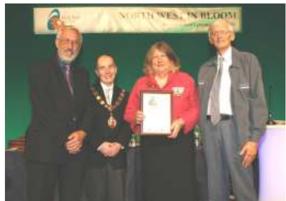
THE NORTH WEST IN BLOOM AWARD 2008

Wesham Town Councillors, Fylde Borough Representatives, Headteachers, Local Police Officers, Sponsors and Prize winners are invited and, after the presentations, a social evening follows with light refreshments. We also celebrated being awarded a runners up certificate in the North West in Bloom competition.