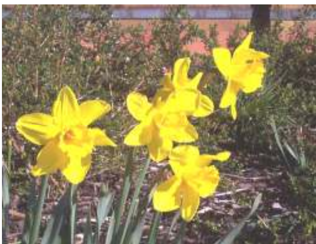
".....with over 1000 daffodil bulbs planted by The Scouts and Volunteers"