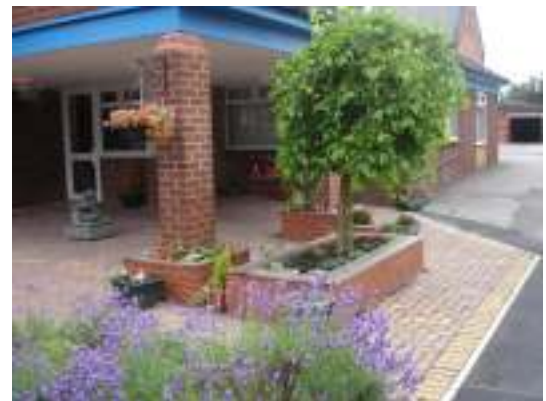
St Joseph's Planting