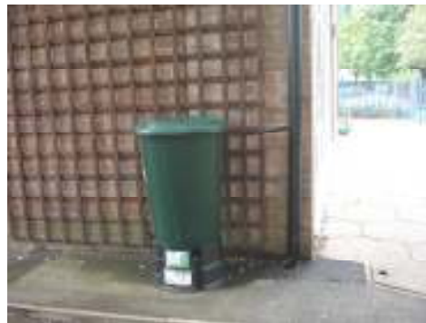
St Joseph's Water Collection