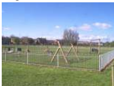
Doorstep Green Play Area