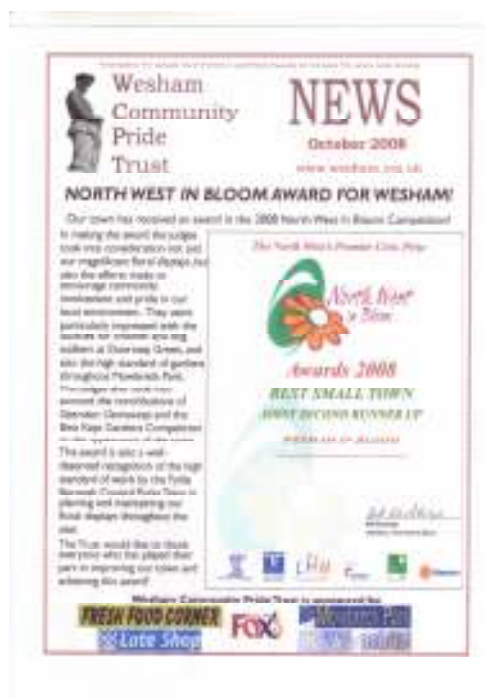
Example of News Posters