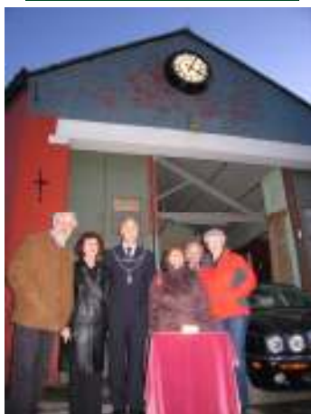
Provision of a Town Clock formally switched on by the Mayor of Wesham