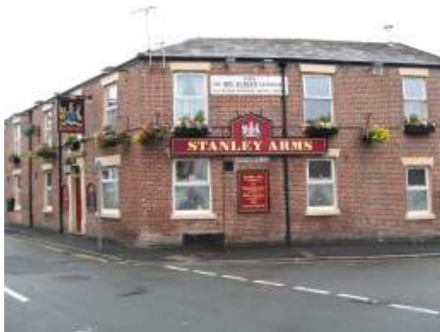
A COMPETITION WINNING LOCAL BUSINESS