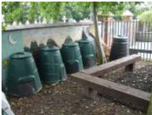
St Joseph's Composting Bins