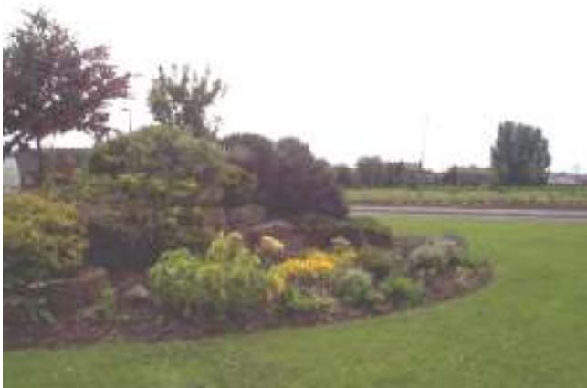
Permanent Planting at Derby House

The Derby House Sheltered Housing accommodation at Derby Road features a permanent rockery, which has been further enhanced on the opposite side of the road by the provision of the 'Doorstep Green' park providing a pleasing area for both young and old.