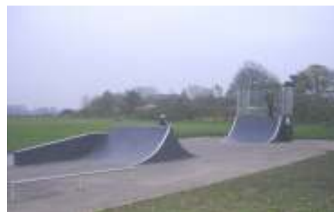
Fleetwood Road Skateboard Park