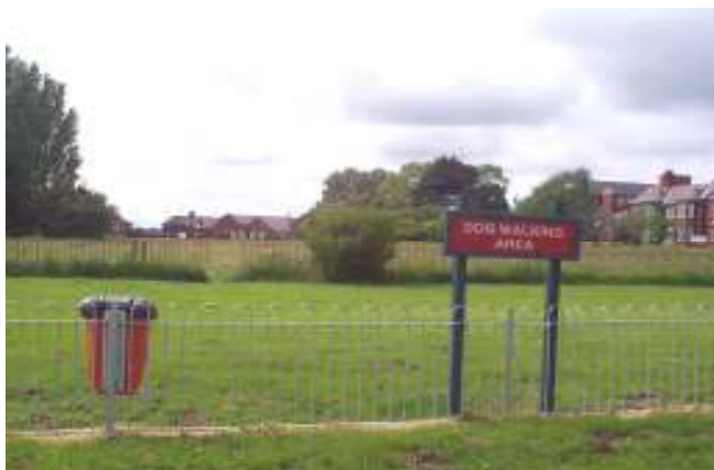
Dog Walking Area with suitable waste collection