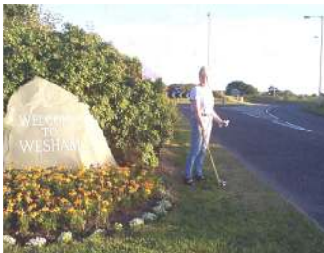
WCPT VOLUNTEER LITTER PICKER

Stalwart Supporters of the Wesham Community Pride Trust play a key role in keeping the floral displays free from litter and help to beautify Wesham.