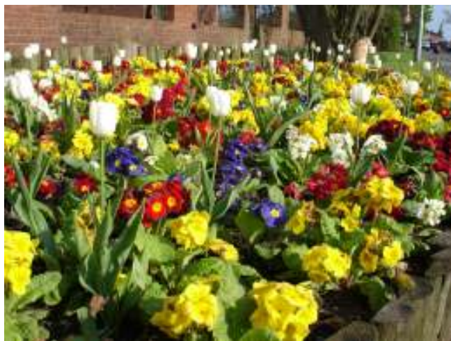
BEDS OUTSIDE THE RECREATION GROUND

Volunteers from the Wesham Gardening Group have planted up the three tier planter at Ash Bend.