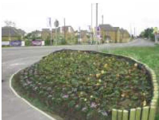
WEETON ROAD BED AFTER