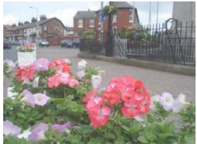
THE WAR MEMORIAL PLANTERS

With the co-operation of the National Probation Service (Blackpool) the 7 white planters have been renovated and planted up to surround the War Memorial.