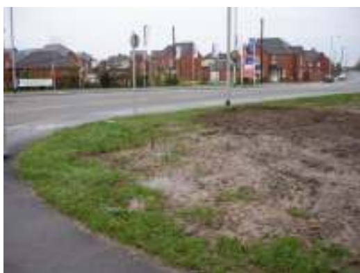
WEETON ROAD BED BEFORE