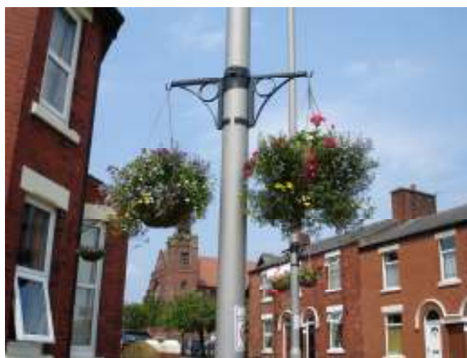
HANGING BASKETS GARSTANG RD NORTH

Floral displays enhance the Town, together with a combination of hanging baskets/tubs and hayracks. Many houses and businesses are brightened up by hanging baskets, many of which are supplied and maintained by the Town Council. Recent additional hanging baskets are now a feature of installations on lampposts.