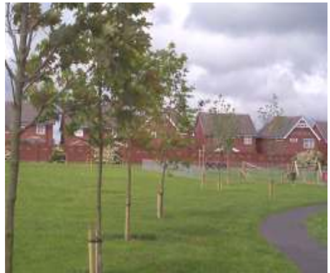
"Doorstep Green" Derby Road Park