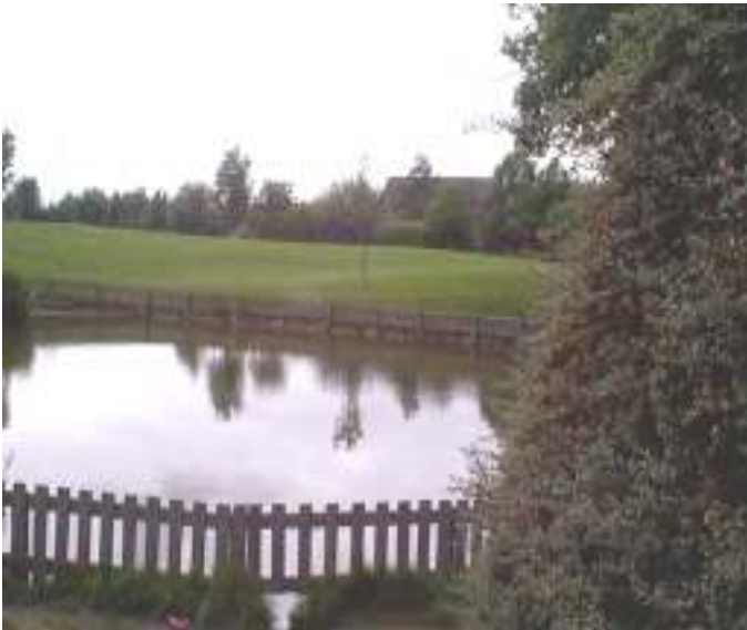
Bowland Grange Pond

The Bowland Grange estate contains a well established pond surrounded by attractive greens, new tree planting and established shrub areas providing a natural home for several ducks !