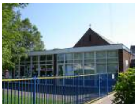
St Joseph's RC Primary