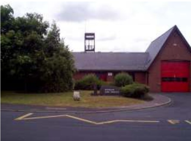
Wesham Fire Station

Wesham plays host to both the Fire and Ambulance Stations, both of which have permanent landscaping to enhance their appearance.