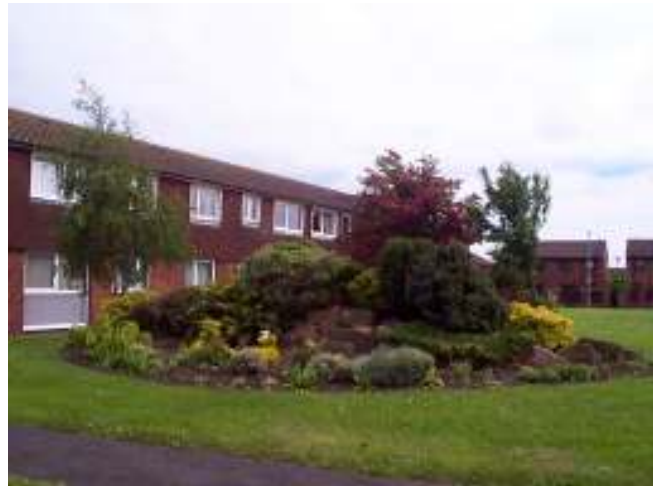
Permanent Planting at Derby House