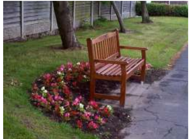
Seating at Meadow Park