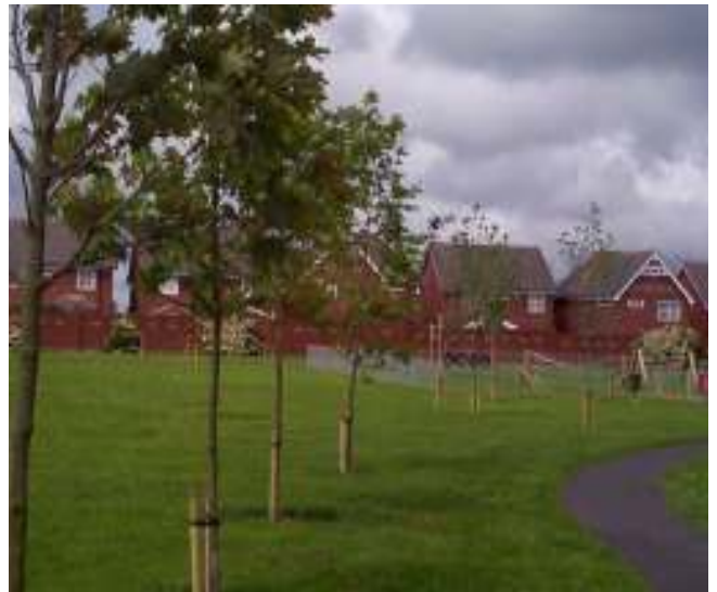
"Doorstep Green" Derby Road Park