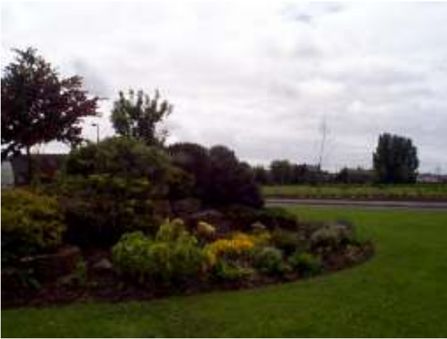
Permanent Planting at Derby House

The Derby House Sheltered Housing accommodation at Derby Road features a permanent rockery, which has been further enhanced on the opposite side of the road by the provision of the 'Doorstep Green' park providing a pleasing area for both young and old.