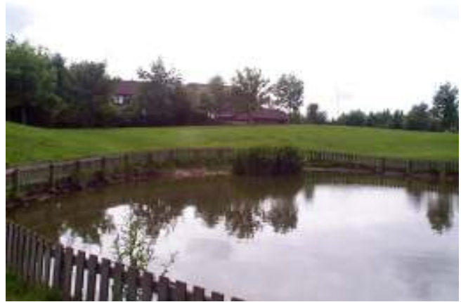
Bowland Grange Pond