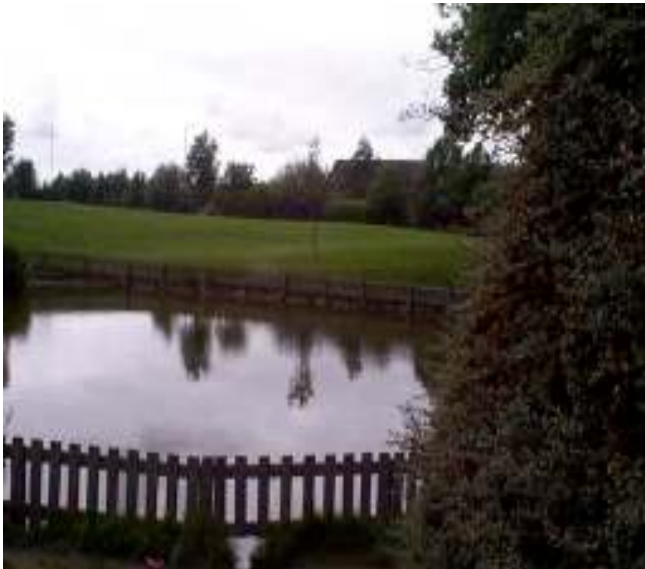
Bowland Grange Pond