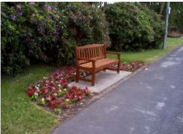
Seating at Fleetwood Road Playing Fields

At various locations throughout the Town seats are provided and are mostly enhanced by floral arrangements.